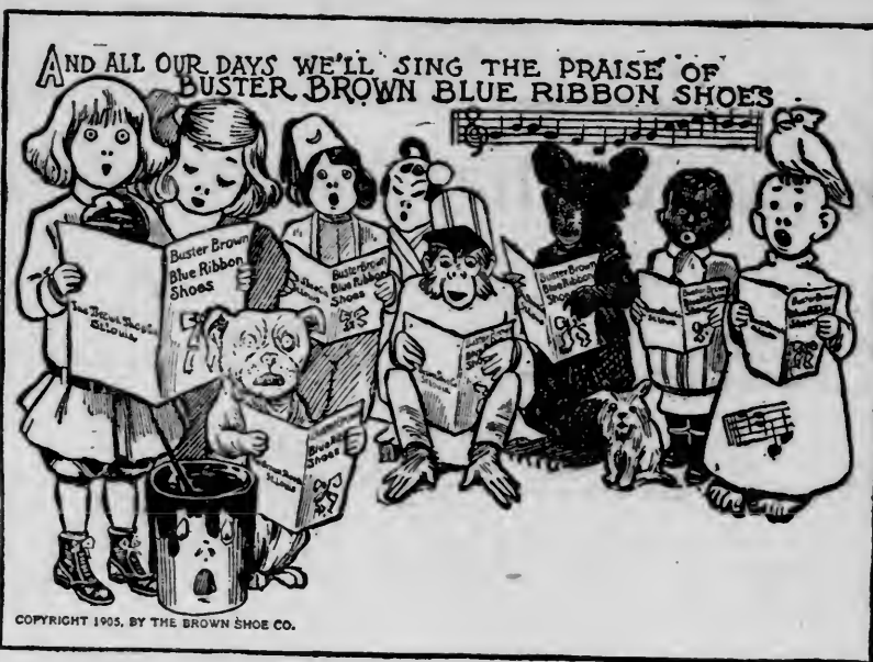
AND ALL OUR DAYS WE'LL SING THE PRAISE OF BUSTER BROWN BLUE RIBBON SHOES

W. L. DOUGLAS and THE BROWN SHOE CO. are, without a shadow of a doubt, the worlds' two greatest Shoe-makers. Desirous of giving our customers the best there is to be had, we are showing both of these great lines. When it comes to a big Stock. Quality and Price, WE TAKE OFF OUR HATS TO NO MERCHANT IN ROCKCASTLE COUNTY.